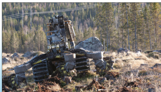
The Bracke T35.b is suitable for large scarification objects and is mounted on large prime movers.