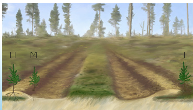
The Bracke T35.b creates planting spots with inverted humus (T), mineral soil mounds on inverted humus (H), and mineral soil mounds (M).