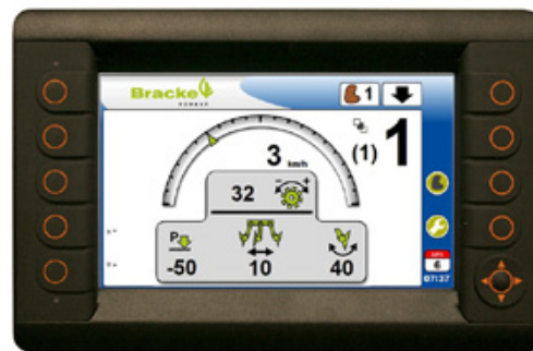
PLC based control system